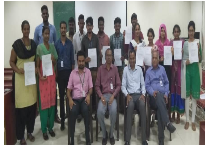
Selected students with recruitment team