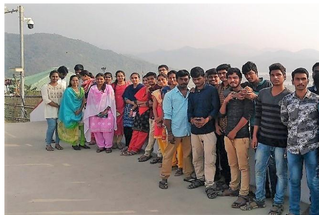
Students at Polavaram project during their industrial visit

III B.Tech CIVIL Engineering students visited polavaram project as part of their industrial visit. The authorities of the project at the site explained about the importance of the project, working process, latest technology being used in the project, water storage capacity, etc. to the students.