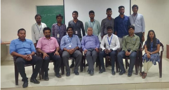
Selected students with recruitment team