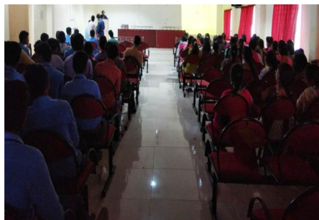
Students at the workshop “Material Science and its applications”

“Let us always meet each other with smile, for the smile is the beginning of love.” -Mother Theresa