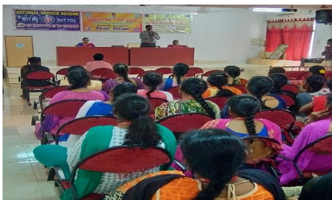
Students at the Awareness Programme, KISHORI VIKAS

This is a session to bring out awareness among girls that girls undergo changes in their physical and emotional states in their adolescent stages. In this regard, Child welfare and women development departments have organized a training session with the name KISHORA VIKAS