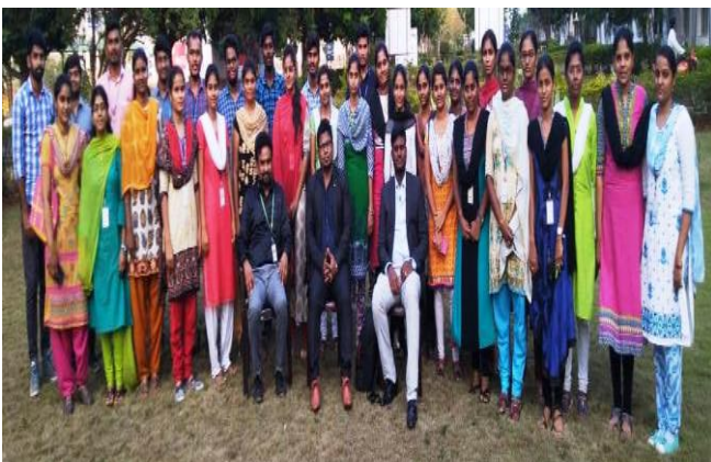
Selected students with recruitment team