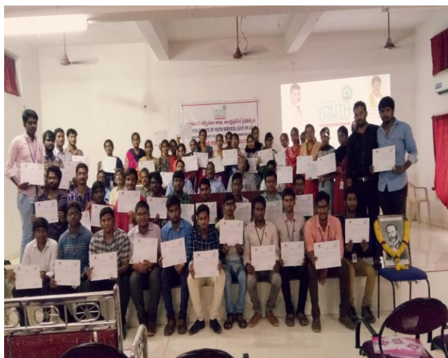
Workshop attendees with their participation certificates