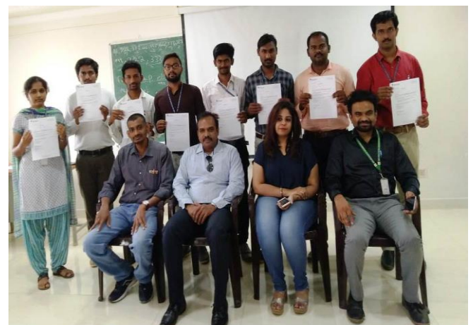
Selected students with recruitment team